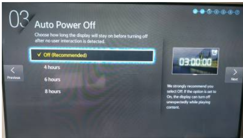
Step 3 : Disable the Auto Power Off

Step 4 : Choose the network adapter, if a RJ45 Network wire is connected, the screen will perform a