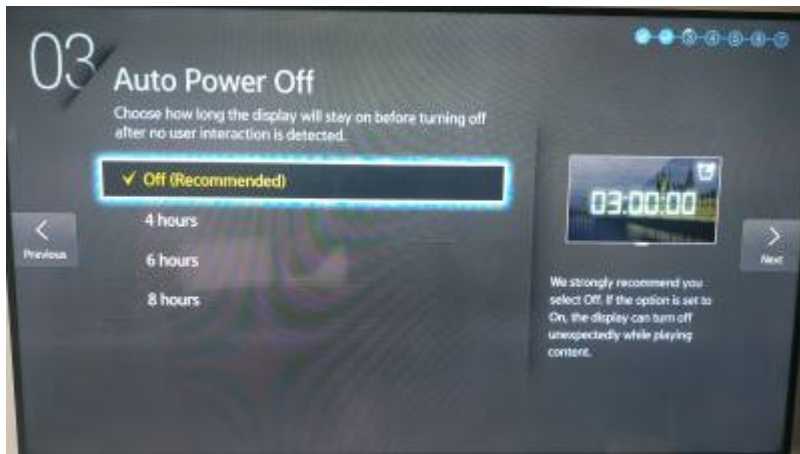
Step 3 : Disable the Auto Power Off

Step 4 : Choose the network adapter, if a RJ45 Network wire is connected, the screen will perform a