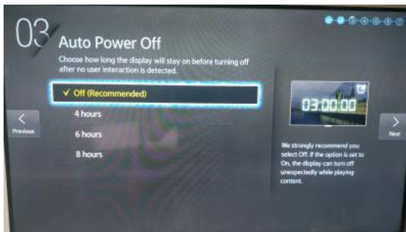
Step 3 : Disable the Auto Power Off

Step 4 : Choose the network adapter, if a RJ45 Network wire is connected, the screen will perform a