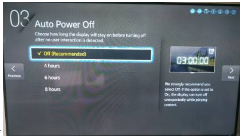
Step 3 : Disable the Auto Power Off

Step 4 : Choose the network adapter, if a RJ45 Network wire is connected, the screen will perform a