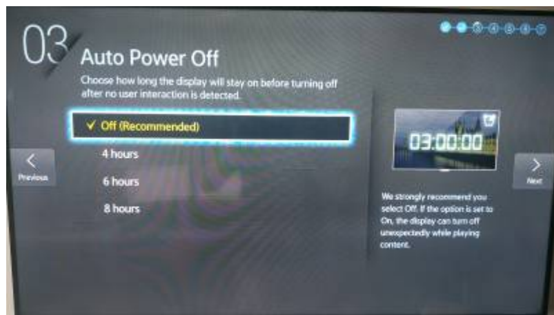
Step 3 : Disable the Auto Power Off